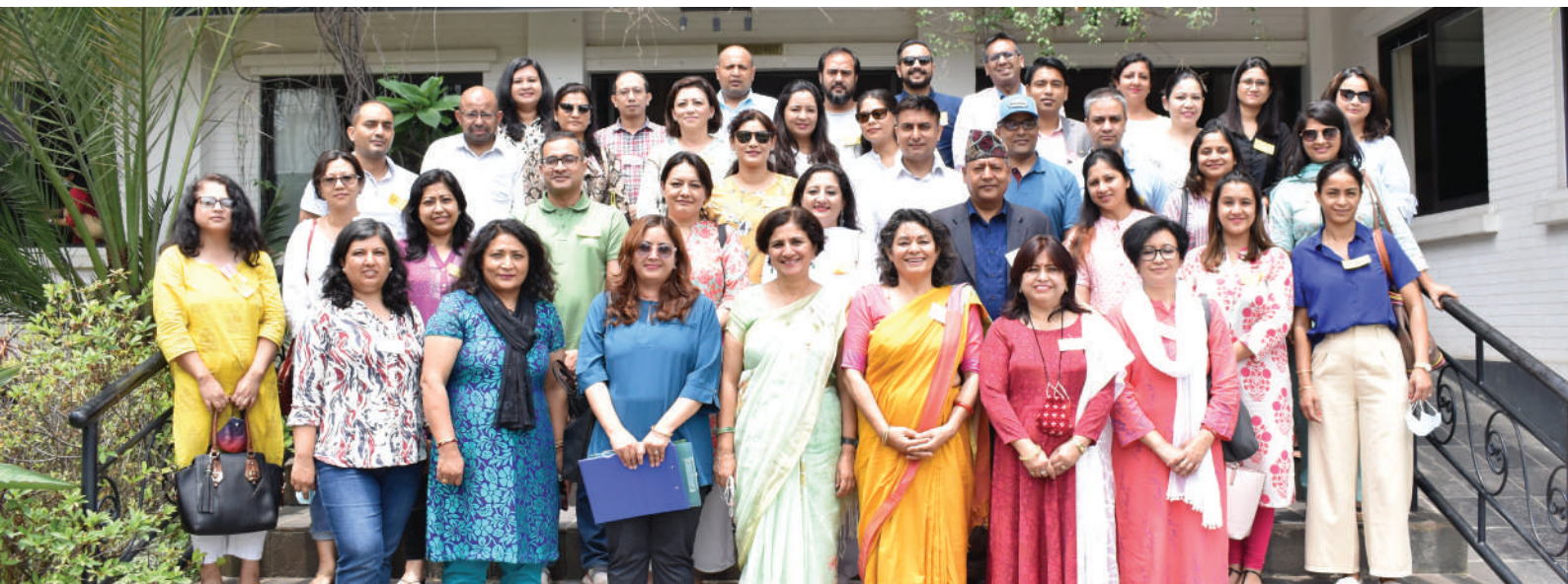
PTA and PR Members