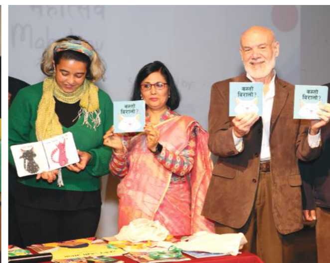
Board books launched at BSM 2020