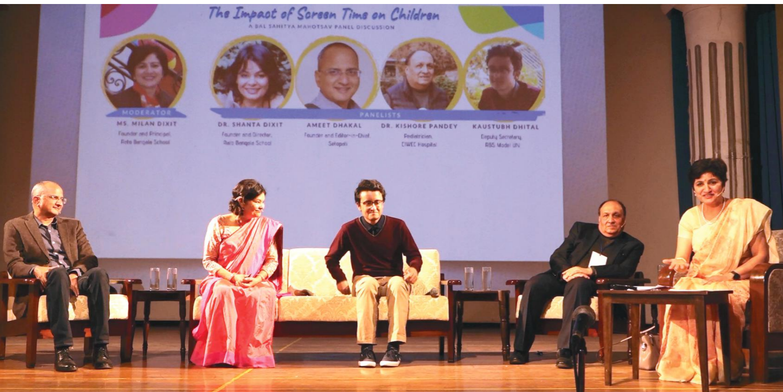
Panel discussion on Impact of Screen Time on Children: BSM 2020

Have a relaxing, healthy and safe vacation. School reopens on 23 April, 2020.