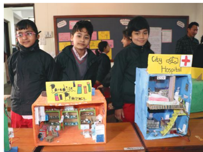
City Project, Grade III